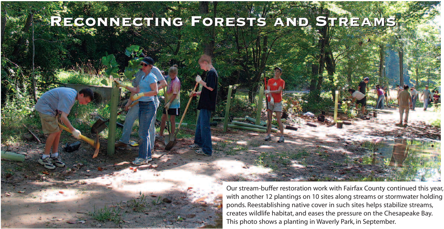
Our stream-buffer restoration work with Fairfax County continued this year, with another 12 plantings on 10 sites along streams or stormwater holding ponds. Reestablishing native cover in such sites helps stabilize streams, creates wildlife habitat, and eases the pressure on the Chesapeake Bay. This photo shows a planting in Waverly Park, in September.