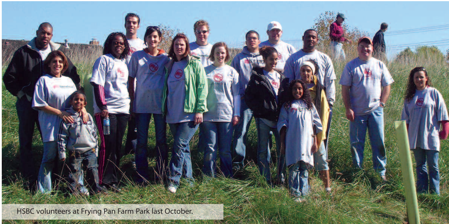
HSBC volunteers at Frying Pan Farm Park last October.